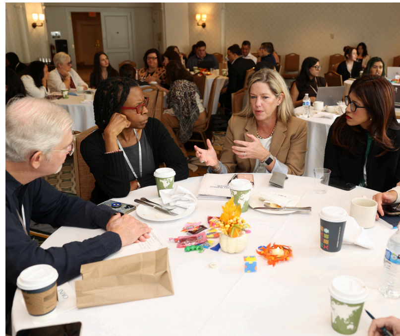
2024 ACS National Navigation Roundtable (ACS NNRT) Annual Meeting in Washington, D.C.

*Some benefits and engagement opportunities are restricted due to membership type.