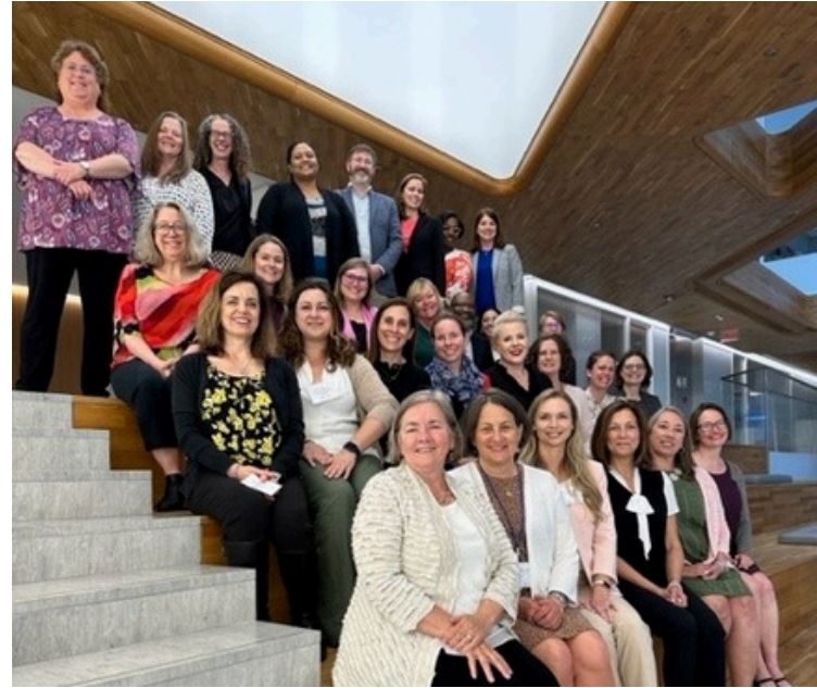
The ACS NNRT Steering Committee in April 2023.